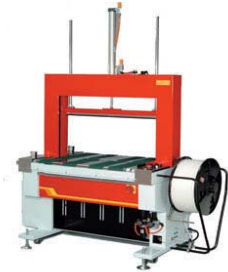
TP-601BP TAURIS TRANSIT with PRESS Fully automatic machine for wide straps Belt-Driven Table with Press